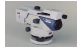
Optical Micrometer OM5 (B20)