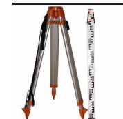
SJA30F Aluminium Tripod