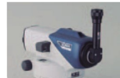
Diagonal Eyepiece DE16 (B20)