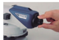
40x Eyepiece EL5 (B20)